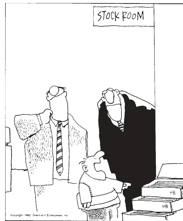
"GEE, MY DADDY HAS BOXES OF THESE SAME PENCILS AT HOME."